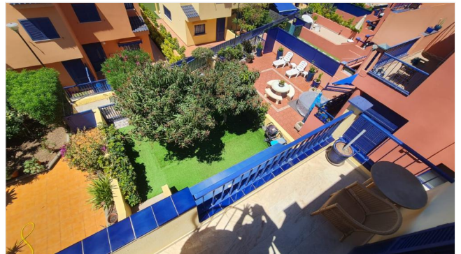
Grundstück_Blick vom Dach