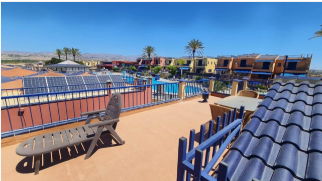
X. Dachterrasse zum Pool