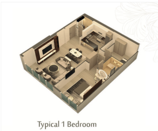
Typical 1 Bedroom