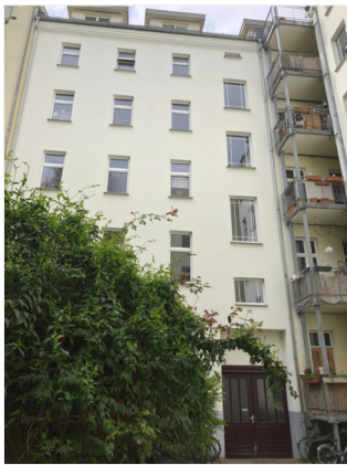
46. Hoffassade VH