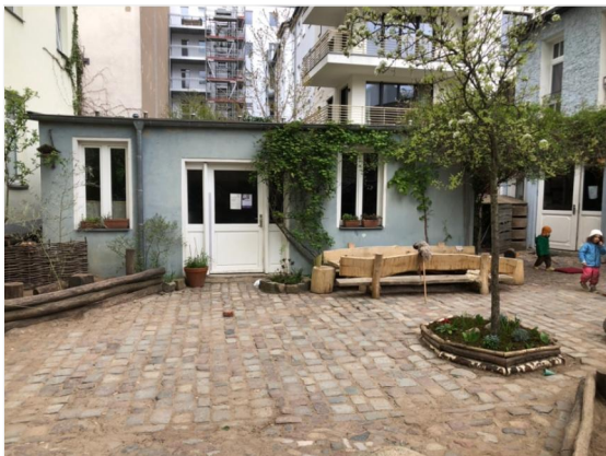
41. Kita kleine Remise