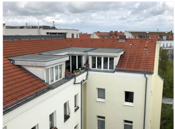
20. Dach Hofseite_HH