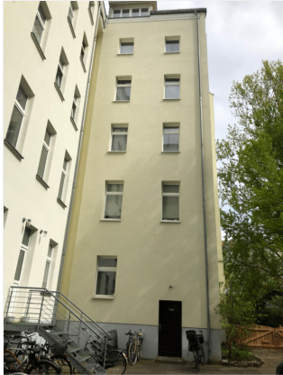
48. Hoffassade HH