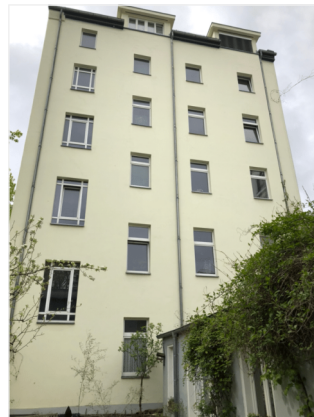
50. Hoffassade ZWEITE Hof HH