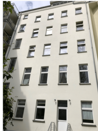
47. Hoffassade SFL