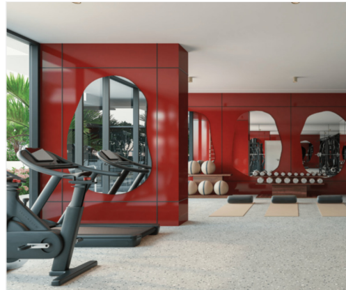
Bildschirmfoto 2023-05-19 um 1