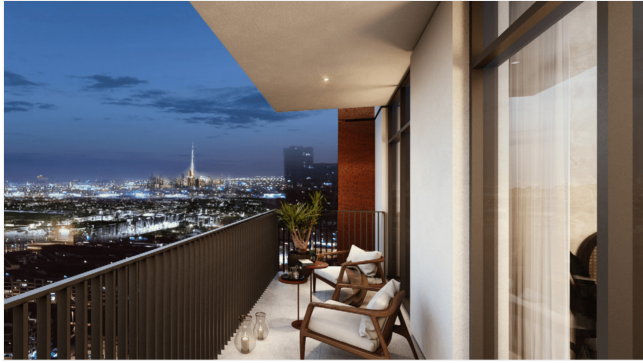
Bildschirmfoto 2023-05-19 um 1