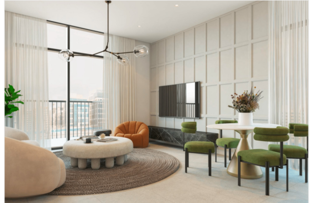
Bildschirmfoto 2023-05-19 um 1