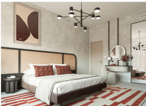
Bildschirmfoto 2023-05-19 um 1