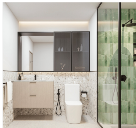
Bildschirmfoto 2023-05-19 um 1