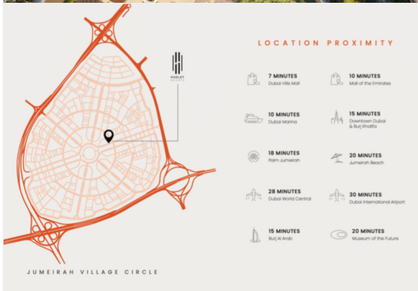
Bildschirmfoto 2023-05-19 um 1