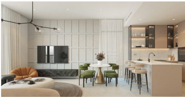
Bildschirmfoto 2023-05-19 um 1