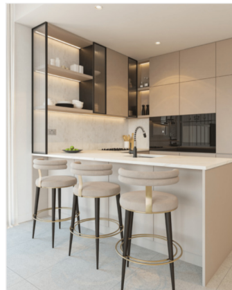
Bildschirmfoto 2023-05-19 um 1