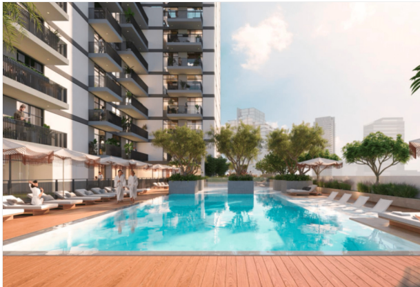
Bildschirmfoto 2023-05-19 um 1